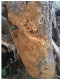
Sumiremo Trentepohlia Color : orange Habitat : wood , in the mountains