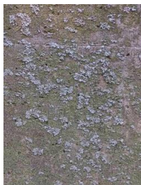
Kohukityorogiumenokigoke Myelochroa metarevoluta Color : greenish-gray Habitat : on a strip of black pine and Jananese cedar and on gravestones