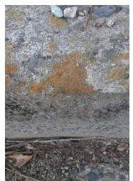
Tsubudaigoke Caloplaca flavovirescens Color : orange (dryness) Habitat : everywhere in Japan, concrete