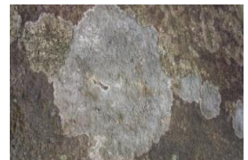
Tyasibugoke-family, Tyasibugoke-genus, Non-identification Color : dark brown Habitat : bark