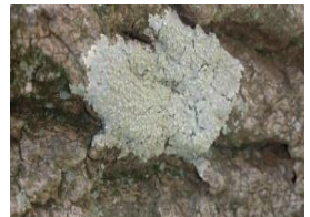
Orienntomukagdegoke Physcia orientalis Color : greenish gray or light gray Habitat : on rocks or bark in warm area