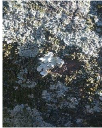
Matsugogoke Rimelia clavulifera Color : white

Habitat : west of Kanto area , blight trunk and branch of the tree of this place , stone wall