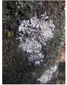
Tyasibugoke Lecanora allophana Color : greenish gray or light gray Habitat : bark which exists in from Hokkaido to Kyushu area