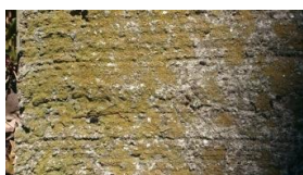
Koganegoke Chrysothrix candelaris Color : yellow or yellowish green Habitat: on the bark in warm-temperate zone